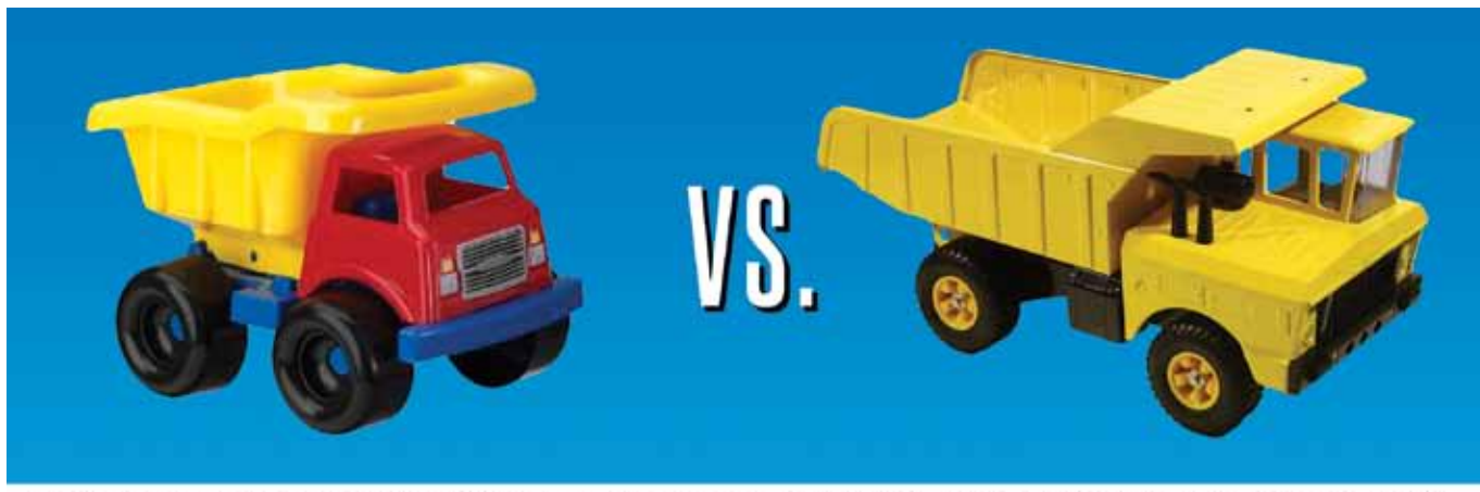
Metals are used because of their durability and perceived value - both of which lead to greater profits.

The most common misconception about laser markable metals is that they are all real metal. In fact, several of the so-called "laser markable metals" are not metal at all, but extruded plastic. Both real metal and metal-looking plastic have their place in various applications; however, it is good to know that a metalized plastic may not look and feel like real metal, a characteristic that many customers expect.