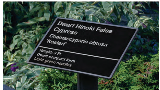
PHOTO QUALITY CO 2 LASERABLE METAL DURABLE CO 2 LASERABLE METAL