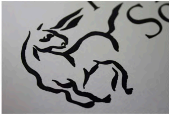
Black Positive Mark