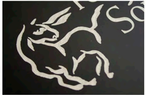
White Negative Mark