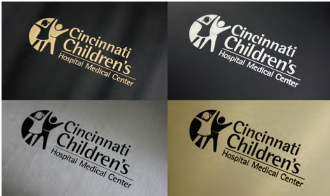
LMMs are durable and have high perceived value.

As a starting point, DPI should be set to 600 or higher. Likewise, the speed can be set at 80 percent for most lasers. All that remains is power. Here are settings we found worked well on our 35-watt laser. Again, every laser is different so use the settings in FIGURE 7 as suggested starting points, but refer to the manufacturer's guide to fine-tune your settings.